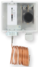
Manual reset option shown